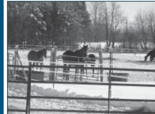
Winningways Farms is not the usual Wisconsin farm. Instead of cows, thoroughbred horses wander through the snow-covered pastures.