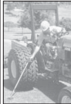
EZ Reacher can pick up items without have to bend and stretch.

Spring is just around the corner and with the warm weather comes the opportunity to spend more time outside. Gardening is one of the many outdoor hobbies that accompany the arrival of spring, but it can also be difficult to enjoy that hobby if a person has orthopedic or arthritic issues.