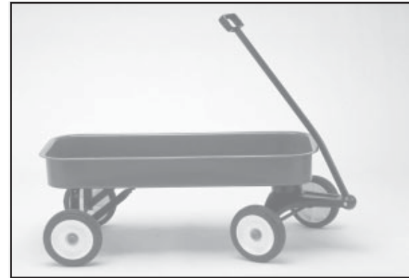
Children's wagons will also be available for rental. (Picture is similar; but does not represent the type of wagon available for rental.)

operation are 9 a.m. to 4 p.m. on Tuesday and Wednesday, and 9 a.m. to 3 p.m. on Thursday. The show will offer more than 350 exhibits, as well as seminars concerning energy efficiency and renewable energy. A booth in hanger C will provide free blood pressure and cholesterol screenings for a small fee.