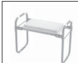
The Garden Kneeler and Bench reduces the strain of kneeling and bending.

The constant kneeling and squatting required in a garden can be reduced with the use of the Garden Kneeler and Bench. It can be used as a bench or turned over to kneel on with