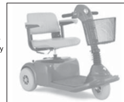
The scooters work well indoor and outdoors, go wherever a person can walk, and are easy to operate.

Due to the incredible response, the WPS farm show found the need to change