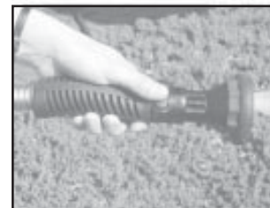
Comfort Grip Hose Nozzle

handgrips to get up and down. Once finished with it, the Garden Kneeler and Bench can be folded up for easy storage. This item is available at Homestead Helpers, www.homesteadhelpers.com or by calling 1-802-644-2658.