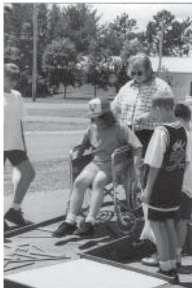
Youth maneuver their way through an obstacle course of ramps, carpeting and doorways with a wheelchair.

AgrAbility of Wisconsin and the national project will be at the World Dairy Expo again this year in Madison, September 29-October 3, 1999.