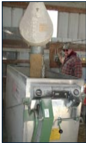
An automatic feeding system and feed cart reduces carrying required for feeding the goats.