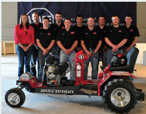
Read about the 2013 Quarter Scale Tractor Team on page 3.